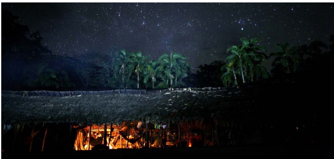
The Yanomami tribe live isolated from the rest of the world in the Demini region of the Amazon rainforest.

The Government wishes to provide more substantial support for the cooperation and exchange of experience between the Norwegian and Brazilian indigenous peoples, for example in the fields of culture, higher education, consultation practices, and natural resources management.