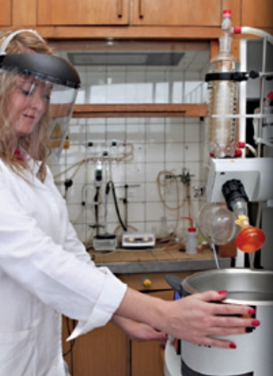
EUR 32.32 million Climate change and environment