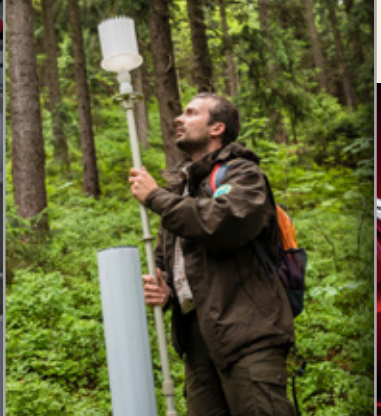
EUR 29.75 million