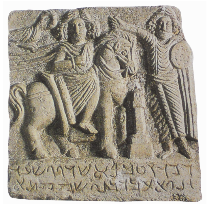
Figure 10: From Syria: Gypsum low relief of "Asadu and Sadai", Dura-Europos, 1st to 2nd century AD, 46 x 46 x 8 cm