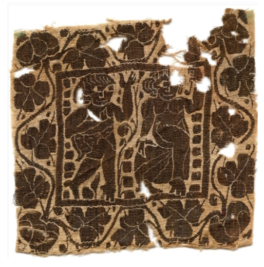
Figure 6: From Egypt: Woven wool and flax textile fragment, 3rd to rd – 9th century AD, 96 x 102 cm