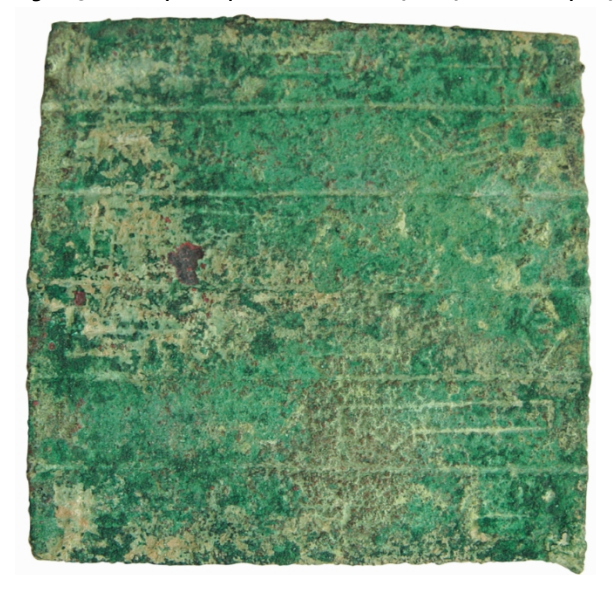
Figure 3: From Syria: Square bronze tablet, Mari, 21st century BC, 11 x 11 cm