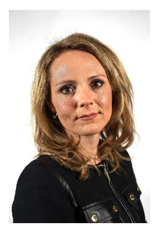
Linda Hofstad Helleland Minister of Culture