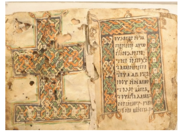
Figure 4: Parchment prayer book, Qasr Elwiz (Nubia), 4th to 6th century AD, 11.6 x 16.5 cm