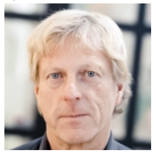
Figure 35: Espen Hernes

Note: Espen Hernes is acting deputy director general of Arts Council Norway's department for culture. Mr Hernes has headed the museum section since 2011, with responsibilities involving development, administration and consulting. Among other things, the section is responsible for following up section 23 of the Cultural Heritage Act relating to the export of cultural heritage objects, and duties under the 1970 convention on illicit trade.