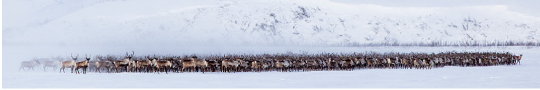
Pic: Canadian Reindeer Herd.