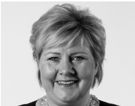
Prime Minister Erna Solberg