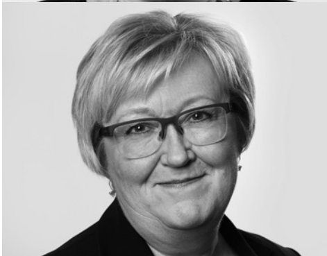
Minister for Nordic Co-operation Elisabeth Vik Aspaker