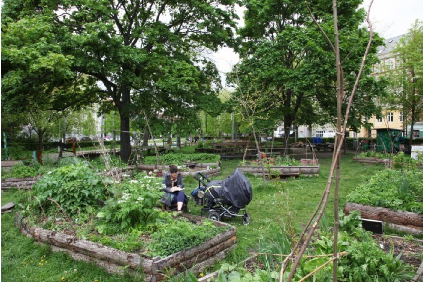
Byhaven 2200, Copenhagen (2012-2017) – R.I.P.

A vision for urban farming, a vision for sustainable cities?