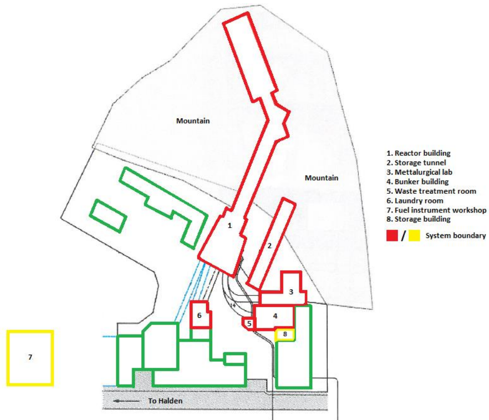
Figure 3-1 System boundaries for the facilities and buildings at the Halden site.