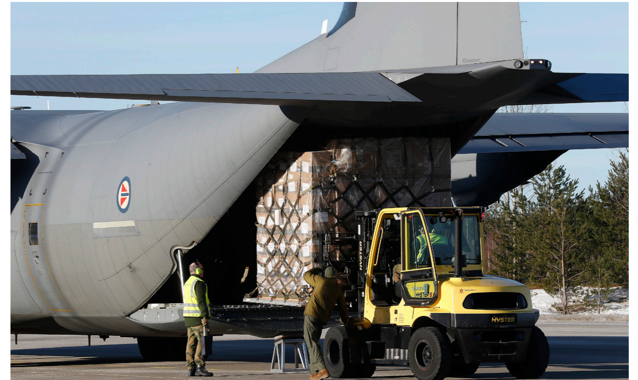
» M72 anti-tank weapons in support for Ukraine loaded onto a C-130J Hercules aircraft from the 335th Squadron of the Air Force.

The Nordic countries have had close dialogue on the situation in Ukraine, as well as support to Ukraine. Throughout the year, there has been frequent dialogue on national policymaking and decisions to support to Ukraine, including materiel, weapons donations, training and other initiatives.