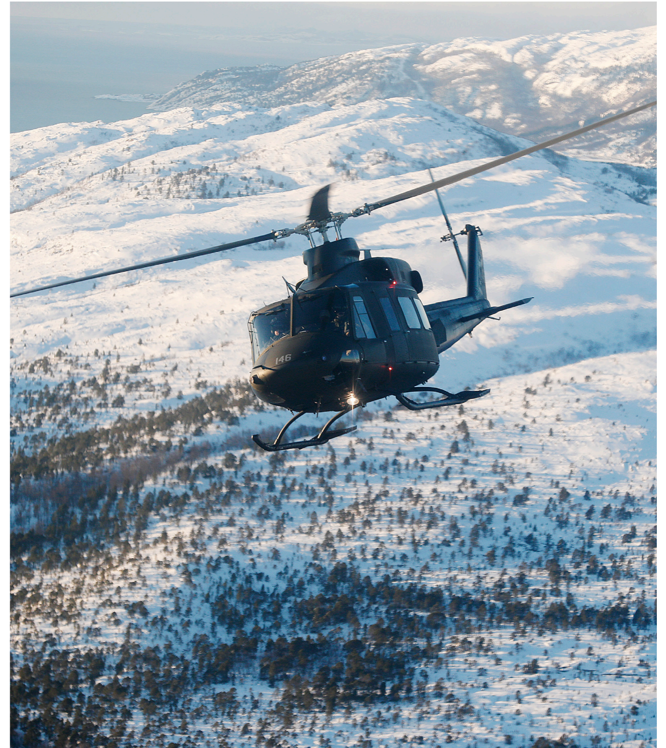
» Bell 412 helicoptre in Northern Norway.

The focus of the discussions has in parallel been the war in Ukraine and Finland's and Sweden's application for NATO membership.