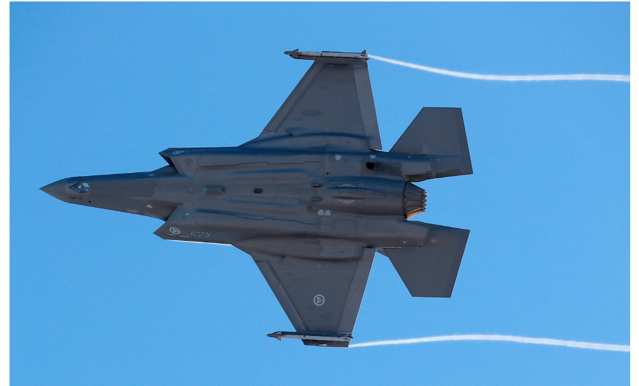
» Norwegian F-35 fighter jet.

To situate this initial capability dialogue, the chair arranged a table-top discussion where the capability directors, through two different scenarios, discussed possible cooperation areas both in the short and longer term framework.