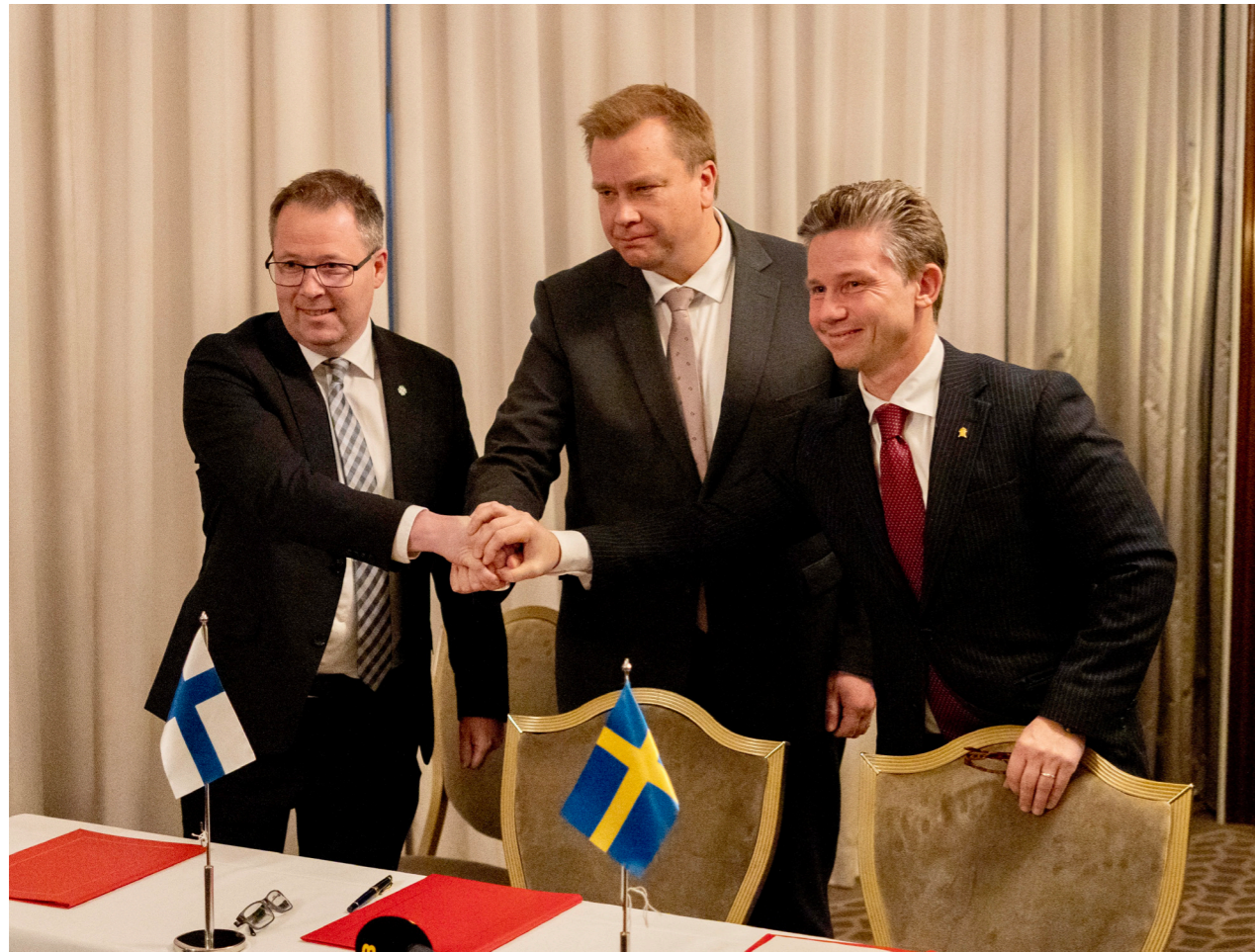
» Norwegian, Finnish and Swedish Ministers of Defence; Bjørn Arild Gram, Anti Kaikkonen and Pål Jonson signing updated Trilateral Statement of Intent, November 2022

MCC priorities for 2022 reflected and supported policy level priorities, and were all met. The historic developments of 2022 added relevance and importance to these priorities, with focus on operational needs as the primary driver for military cooperation.