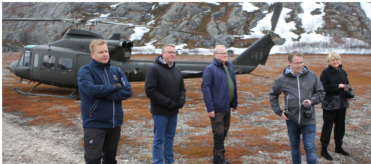
» The Nordic ministers of Defence in Kirkenes 11 May 2022.

As the year developed, focus turned to the war in Ukraine and Finland's and Sweden's application for NATO membership. There has been close and regular contact between our countries on all levels. The defence ministers met in Northern Norway in March during Exercise Cold Response, in Kirkenes in May for the NORDEFECO Ministerial, and in Oslo in November for the second NORDEFECO Ministerial. The ministers also met on Bornholm in May on Danish initiative and on Gotland in September on Swedish initiative. In addition to physical meetings, the classified NORDEFECO system has been used on a weekly basis. Close consultation among the Nordic countries on all levels has been important to share information, build situational awareness and develop our cooperation.