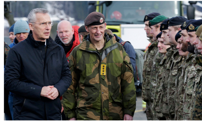
» NATO Secretary General Jens Stoltenberg and Norwegian Chief of Defence General Eirik Kristoffersen greeting soldiers from participating countries at Bardufoss Airport during exercise Cold Response 2022.