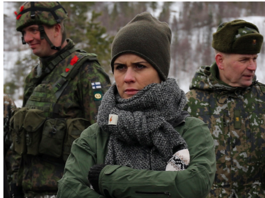
» Iceland's Minister for Foreign Affairs, Thórdís Kolbrún Reykjaförð Gylfadóttir, in front of Finnish soldiers at exercise Cold Response 2022 in Norway.