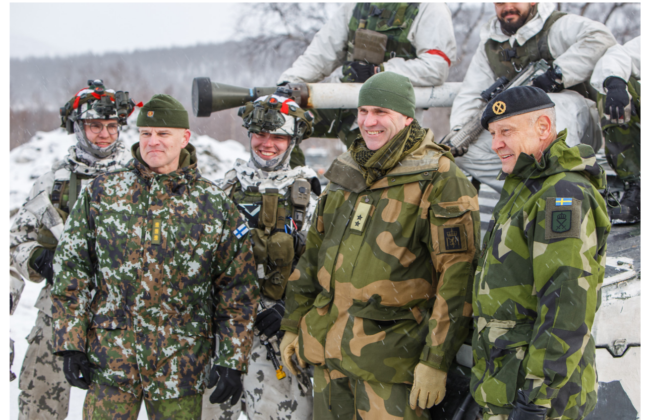
» Finnish, Norwegian and Swedish Army Chiefs with Finnish soldiers at exercise Cold Response 2022.

Joint training and exercises is an essential part of the increased focus and efforts on operational cooperation. The planned Norwegian invite exercise COLD RESPONSE 2024 has been renamed NORDIC RESPONSE. Preparations and execution of the exercise will be used by the Nordic countries as an environment to develop and refine the Nordic defence concept and plans. Within the NORDEFECO framework the Nordic countries are working on further strengthening cooperation on planning joint training and exercises in general to support common plans.