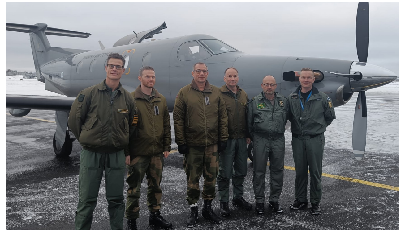
» Meeting about the NORCACC initiative in Finland in December 2022.