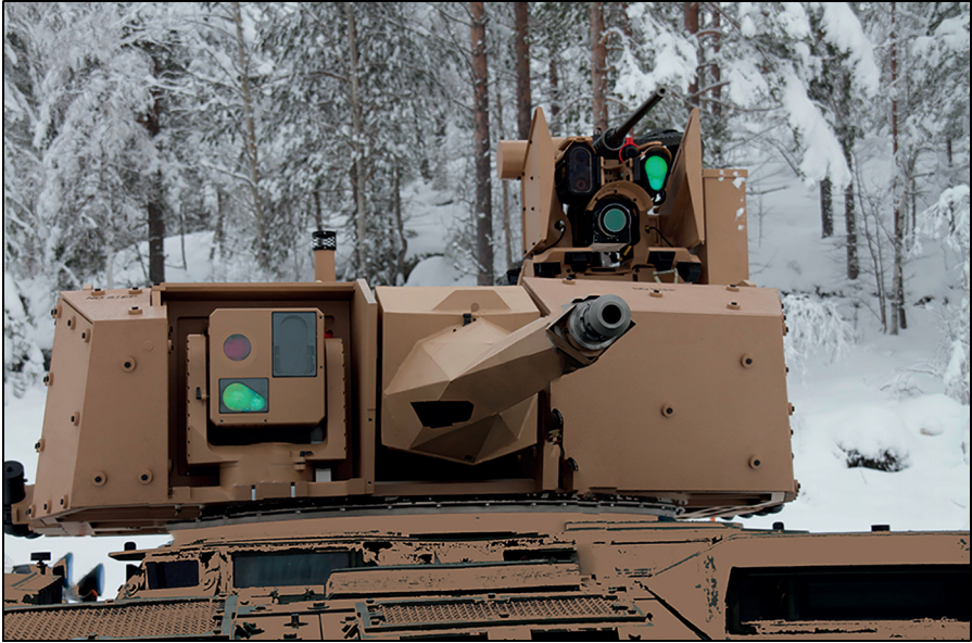
Figure 1.4 The Protector weapon station can be remotely operated with high precision from a protected position inside a vehicle, thus protecting operators as well as reducing collateral damage.