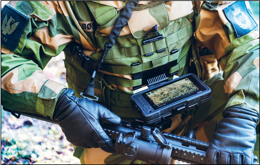
Figure 1.3 The MIME program has been initiated to modernize a holistic tactical information infrastructure for the Armed Forces. An additional goal of the program is to make the development process for the ICT solutions, systems and services more efficient.