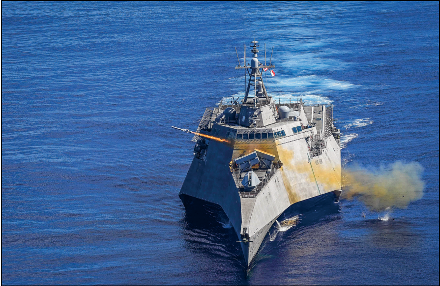
Figure 1.1 The Naval Strike Missile augments the operational capability of numerous international navy vessels, including the US littoral combat ships.