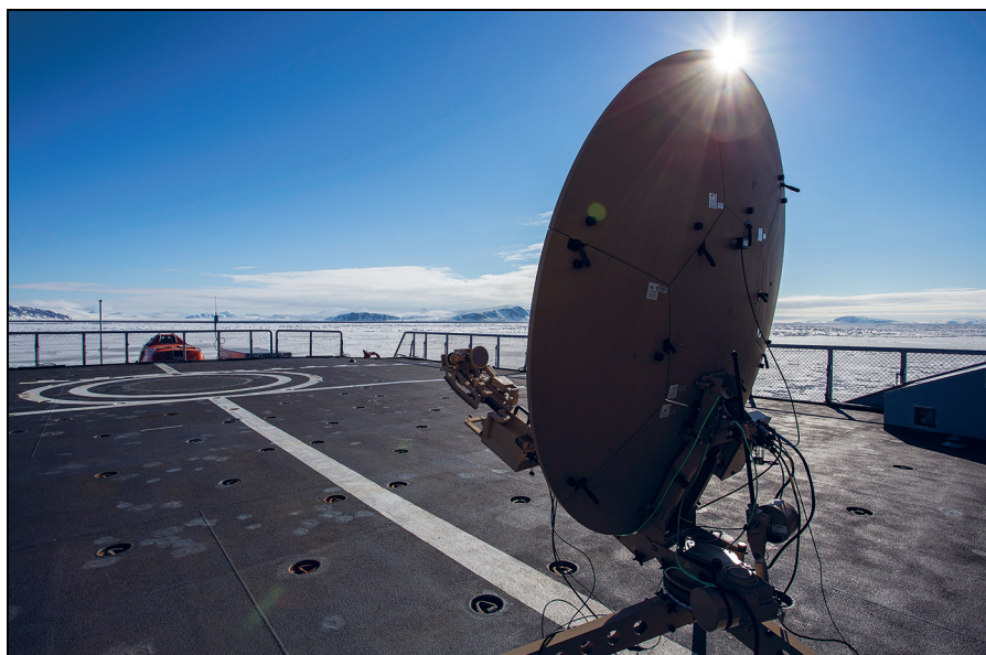
Figure 1.2 The Norwegian Defence Materiel Agency is testing the use of satellites to provide broadband coverage north of Svalbard.

Emerging and disruptive technologies include big data, artificial intelligence, autonomous systems, quantum technology, space technology, hypersonic technology, biotechnology and human enhancement, as well as innovative materials and production methods. These areas are expected to receive increased attention from NATO and will influence