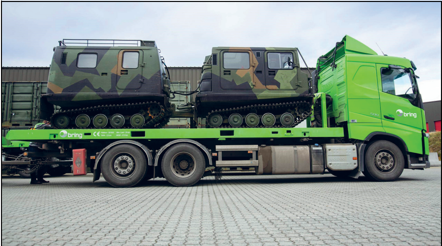
Figure 1.5 The Armed Forces has entered a strategic agreement with the logistics provider Bring to secure transport services. The agreement entails that Bring employees and materiel will be made available to the Armed Forces in times of crisis or armed conflict. Bring will also participate in the Armed Forces training and exercises.

Strategic partnerships with industry will help the Armed Forces secure long-term access to materiel, services and expertise, while improving the ability to act in accordance with the principle “as civilian as possible and as military as necessary”. With advances in technology and digitalisation, there is a continuous need to devise new ways of working. This dynamic must be turned to advantage in a way that increases defence capability. Technology itself does not create a more effective organisation. Benefits arise when technology, personnel, expertise, organisational structure and management are properly coordinated. Advances in technology and digitalisation make it possible to reap benefits in a wide range of Armed Forces’ activities, including system support, security of supply, development and application of new technologies, purchase of services and materiel acquisitions.