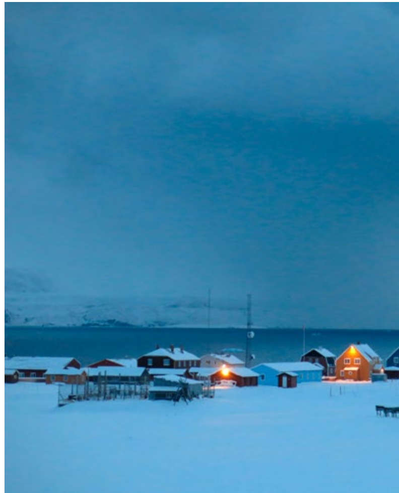
Ny-Ålesund settlement, winter. Photo: Max König / NP (section of image)