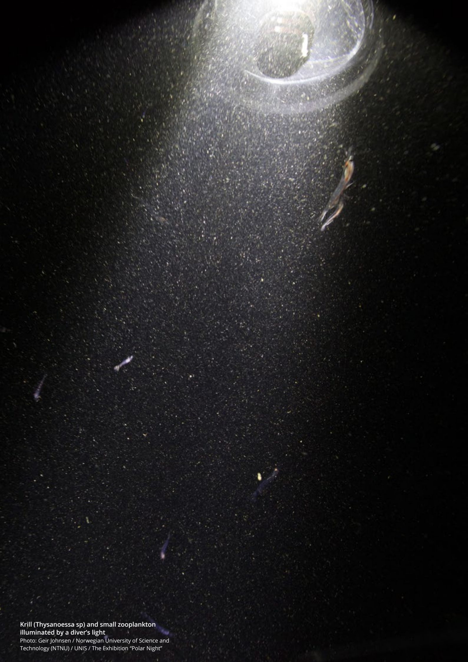
Krill ( Thysanoessa sp) and small zooplankton illuminated by a diver's light