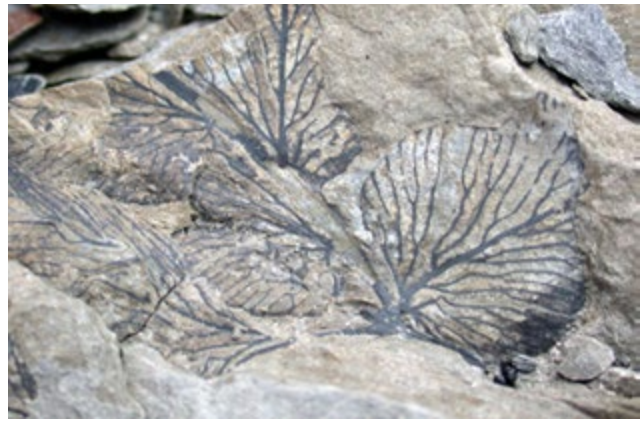
Impressions of fossil leaves in Tertiary sandstone