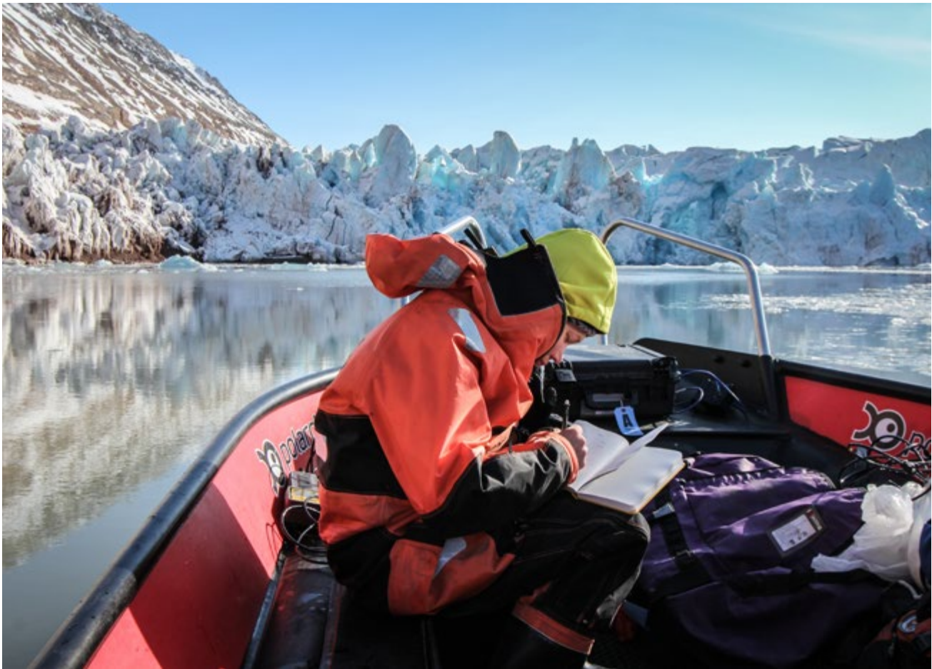
The impact of glacier retreat on fjord circulation and the ecosystems, Kronebreen.