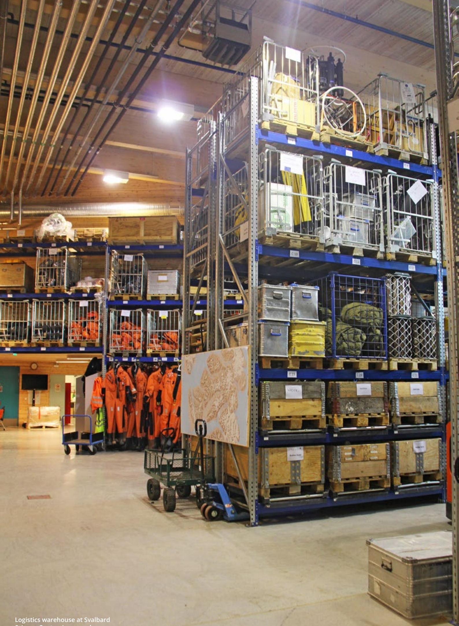
Logistics warehouse at Svalbard Science Centre, Longyearbyen (section of image)