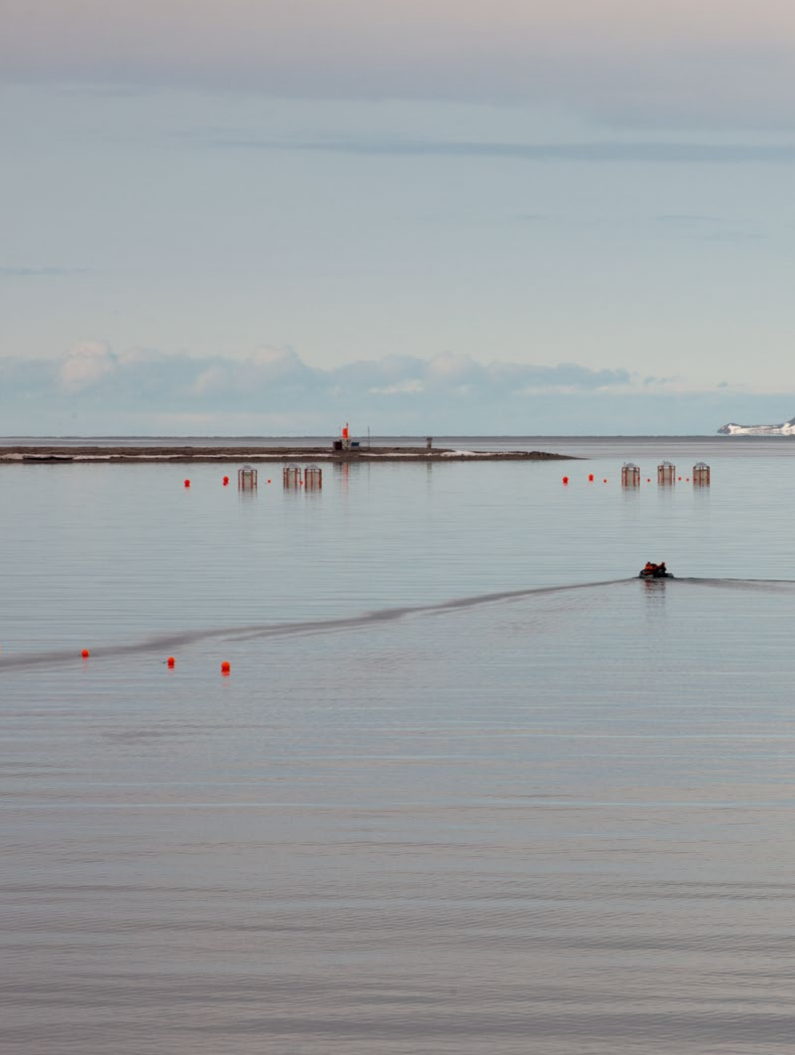
Ocean acidification experiment in Kongsfjorden