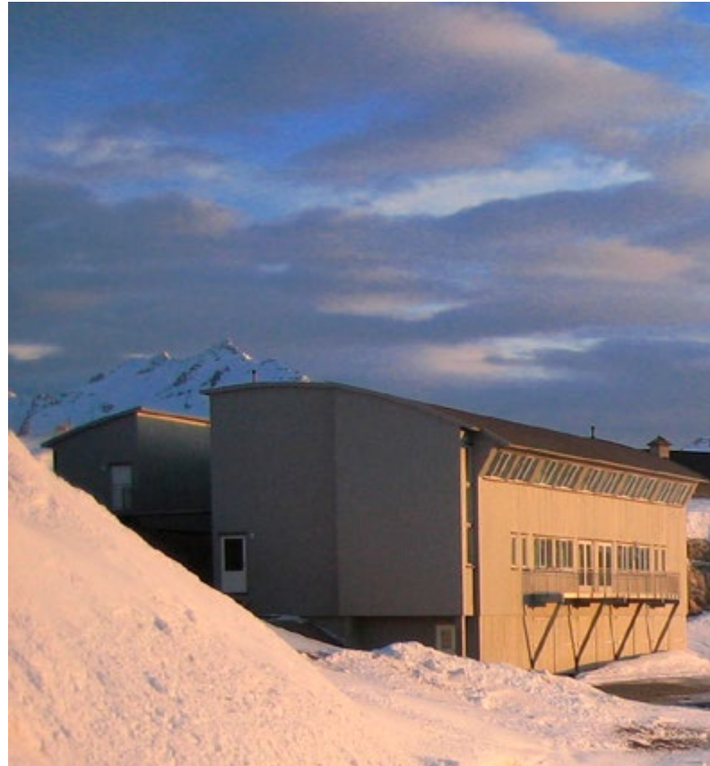
The Marine Laboratory, the first joint research infrastructure in Ny-Ålesund.

In 1998 the Norwegian authorities set up the Svalbard Science Forum (SSF) to increase cooperation, coordination and information sharing between all the research sites in Svalbard (Longyearbyen, Ny-Ålesund, Barentsburg and Hornsund) as well as to strengthen cooperation between individual researchers and research institutions in Svalbard, both Norwegian and international. The Norwegian Research Council heads SSF and operates the secretariat. The secretariat administers schemes to support cooperation in research and fieldwork, with both Norwegian and international actors eligible to apply. The support schemes have been essential to the establishment of joint flagship research topics in Ny-Ålesund and the Kongsfjord area.