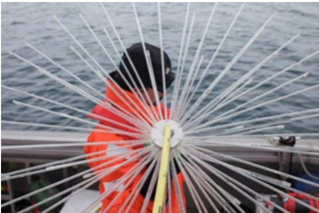
Spider for injecting CO 2