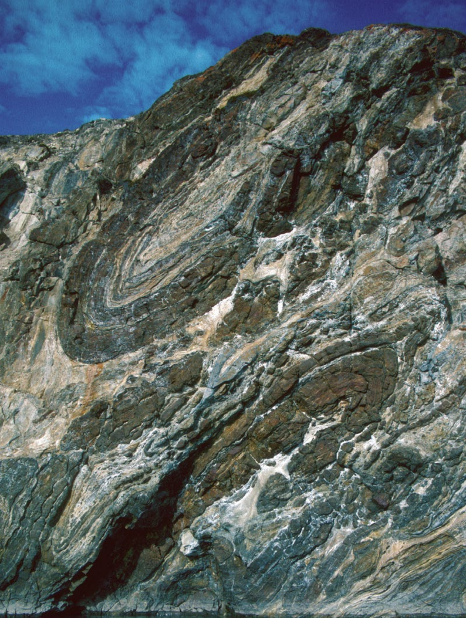
Basement rocks