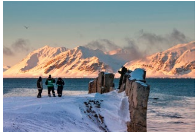
Students at Festningen, Grønfjorden near Barentsburg

All activity must be consistent with environmental regulations and make accommodation for Svalbard's vulnerable natural environment and cultural heritage sites. In all phases of research and educational activity, attention must be paid to minimising the footprint and overall impact on the environment. This can be achieved by coordinating activities and sharing fieldwork data and results. Whenever possible, remote measurement and automated data collection should also be employed to reduce environmental impact.