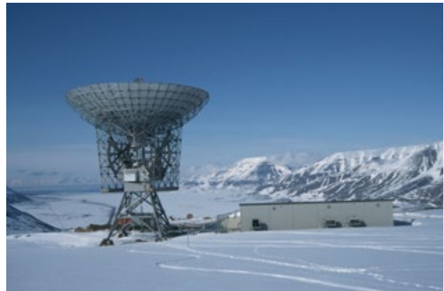
The EISCAT aerial outside Longyearbyen Photo: Bjørn Frantzen / NP (section of image)