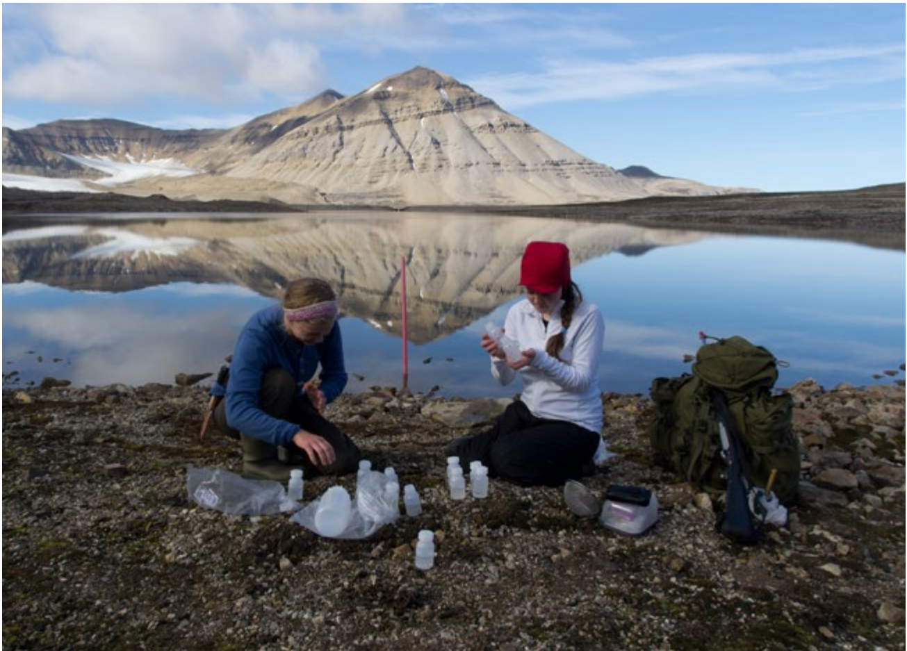
Arctic biology students conducting fieldwork.