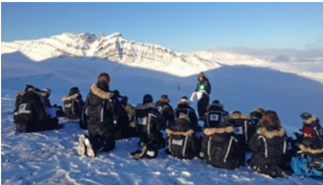
Arctic geology lesson