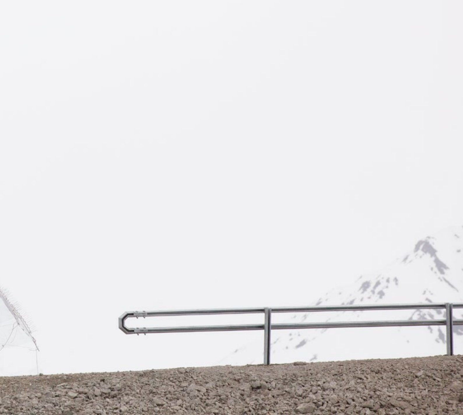
Scientists with mesocosm rooves

The strategy is a long-term platform that determines the frameworks and principles for research and higher education in Svalbard. The strategy conveys what the Norwegian authorities expect of knowledge communities in Svalbard, contributes to a clearer Norwegian role as host and encourages collaborative research activities in Svalbard. The strategy outlines high-level objectives and ambitions while clarifying the frameworks for forward-looking and sustainable development of research and higher education in Svalbard. The frameworks and principles