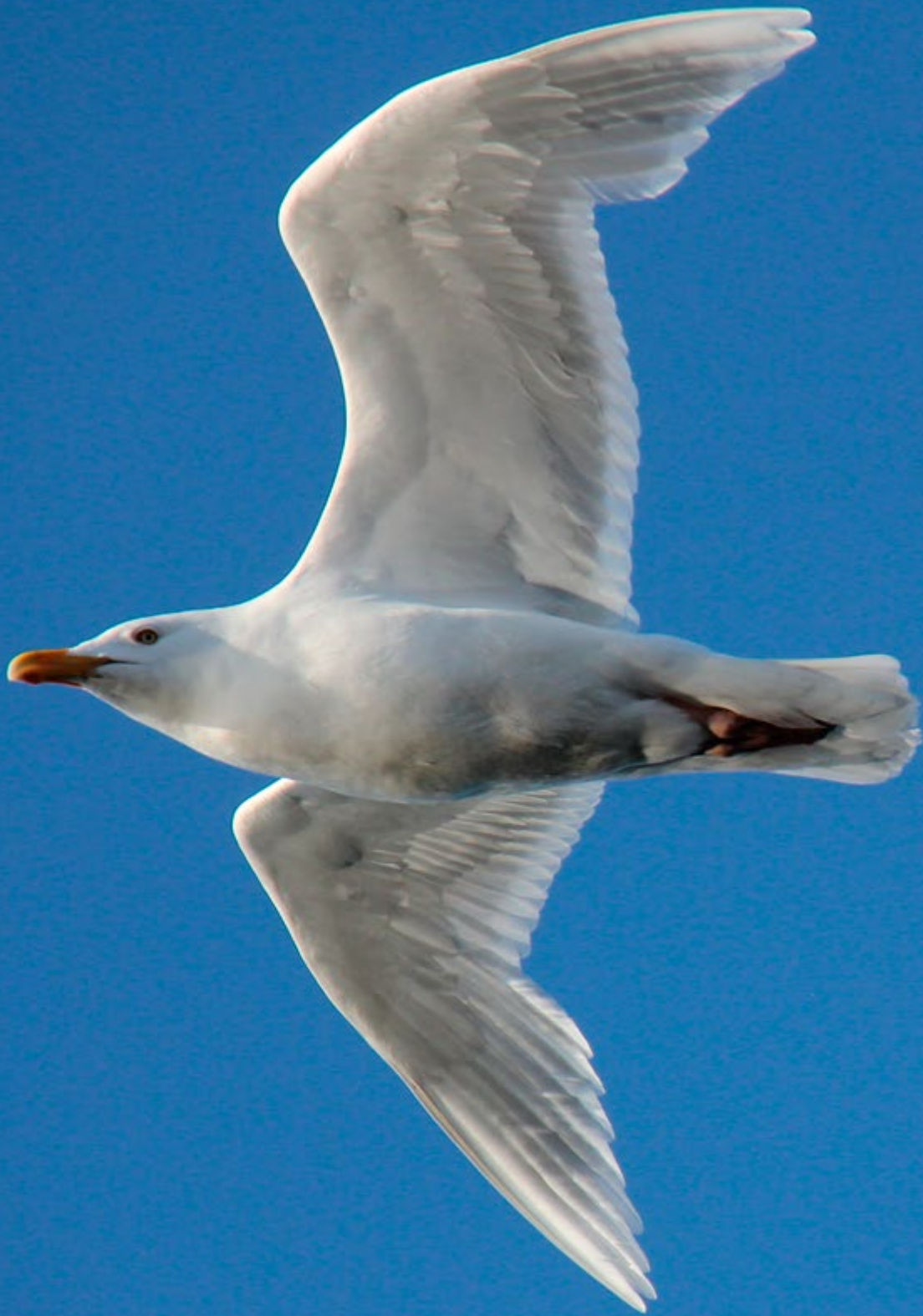
Glaucous gull ( Larus hyperboreus ) (section of image)