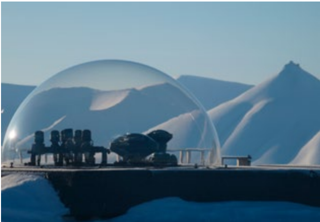
Kjell Henriksen Observatory, waiting for solar eclipse