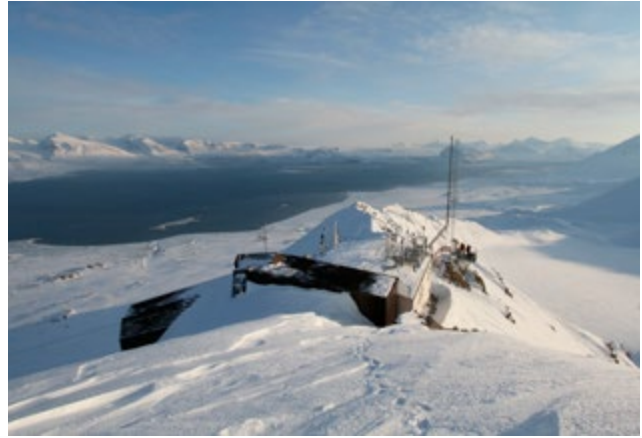
The Zeppelin station above Ny-Ålesund

(section of image)