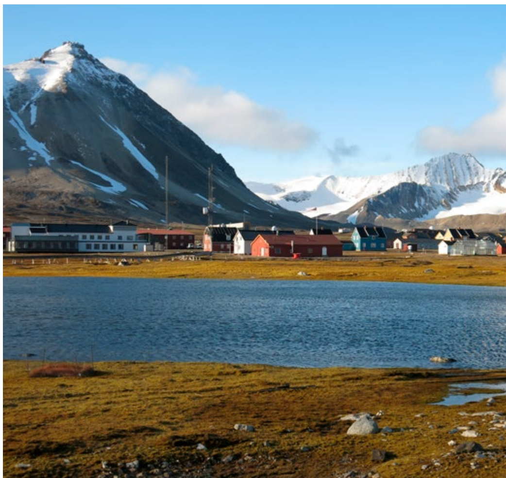
Ny-Ålesund settlement, summer. (section of image)