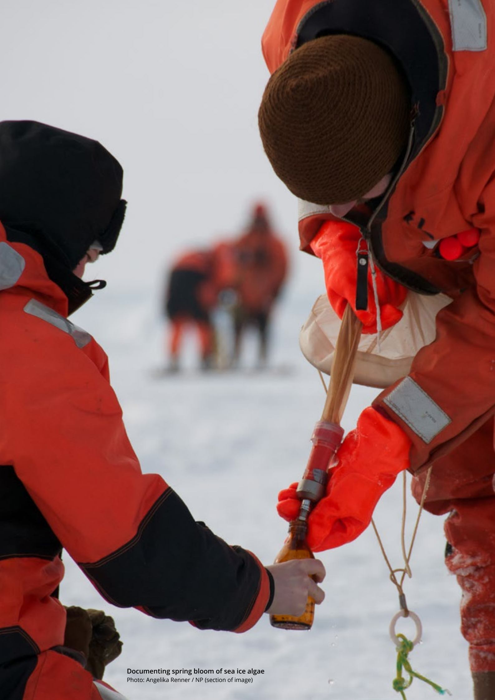
Documenting spring bloom of sea ice algae (section of image)