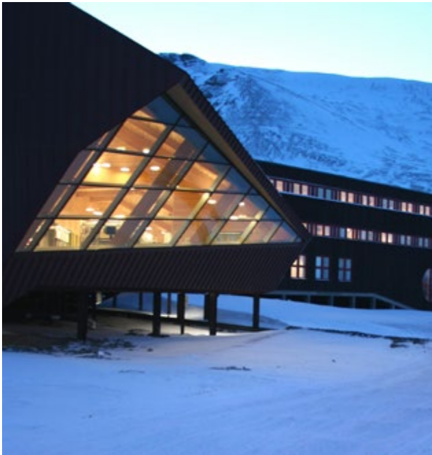
Svalbard Science Centre in Longyearbyen

The higher education provided in Svalbard must maintain a high level of quality. The provisions Norway has made for higher education in the archipelago are through UNIS. To establish other institutions of organised higher education (university and university college level) in Svalbard is not desirable, but education is also a natural part of research. Such student activities should occur in affiliation with a research community with activities in Svalbard, and as a rule should be field based, expedition based or directly linked to research activity or research infrastructure in Svalbard.