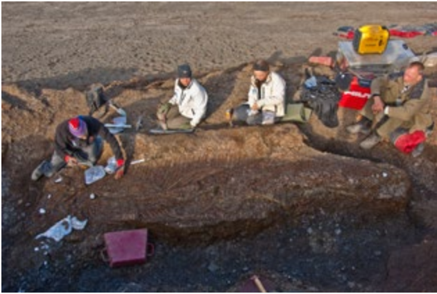
Excavating an Ichthyosaurus ( Cryopterygius kristiansenae )