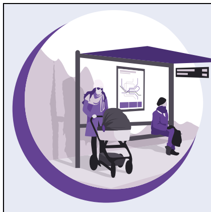
Figure 5.6 Make travelling easier and increase the competitiveness of Norwegian business and industry

Values are created all over Norway and form the basis for our prosperity. The freedom to travel to work and school or to recreational activities and friends is important for individuals and for the overall welfare in Norway. The transport system contributes to value creation by enabling high labour force participation, good residential and labour market regions, sustainable use of the country's resources and extensive trade with the rest of the world. The transport system shall be so designed that it helps to ensure that Norway remains a good place to live, regardless of age and functional ability. Universal design is key principle to achieve this.