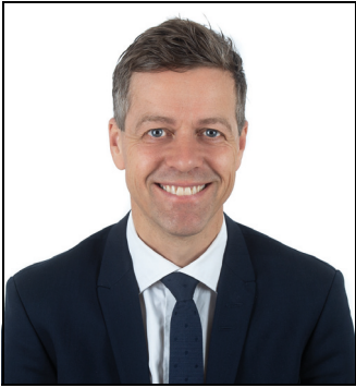
Figure 0.1 Knut Arild Hareide Minister of Transport

Transport is first and foremost about people – about travelling safely and efficiently together. In a country like Norway, with its extensive coastline, high mountains and long fjords, we need to connect urban and rural areas and the people who live there.