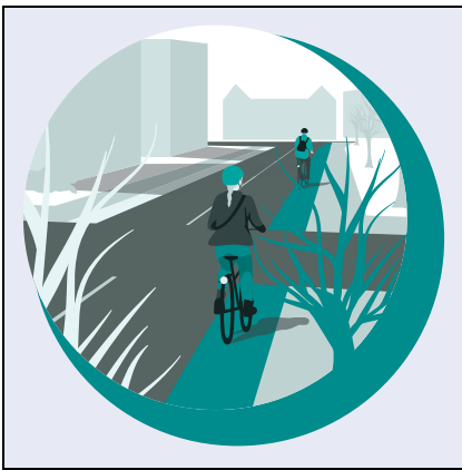
Figure 5.5 A vision of zero traffic fatalities and serious injuries

The “vision zero” for a transport system where no one is killed or seriously injured applies to the entire transport sector. Measures to achieve the vision zero will have a positive impact on Sustainable Development Goal 3.6 of halving the number of global deaths and injuries from road traffic accidents.