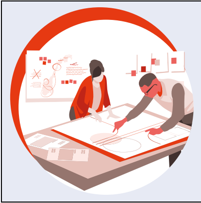
Figure 5.2 Value for money

The ambitions for the transport plan have never been higher, and it is important that the large amounts invested are used efficiently. The work on the plan has therefore been permeated by the goal of getting value for money. Furthermore, investments in transport can benefit from associated value chains when projects are implemented.