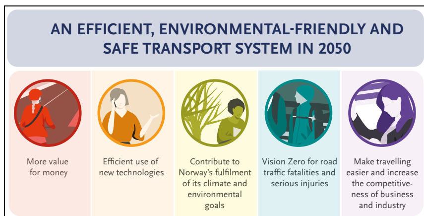
Figure 5.1 The policy objectives for the transport sector

The global Sustainable Development Goals have inspired the overarching objective for the transport plan. The transport plan and its follow-up will have a positive effect on Norway's possibility of achieving several of the Sustainable Development Goals by 2030.