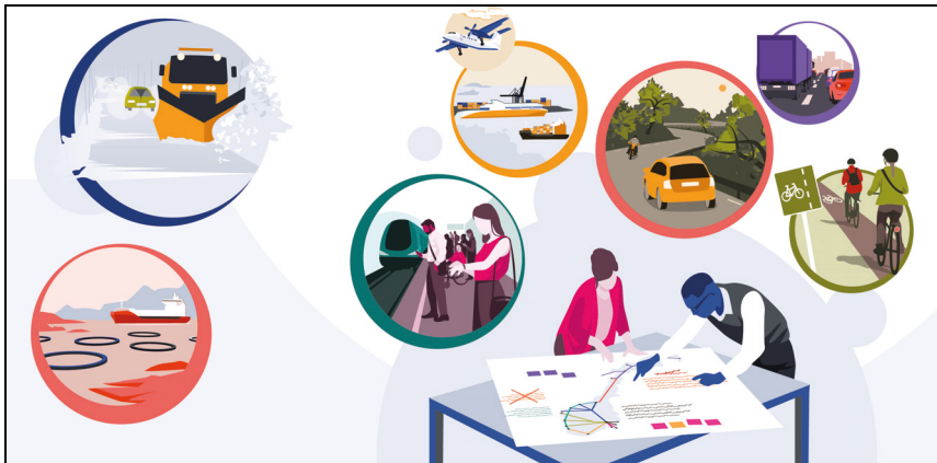
Figure 2.1 Transport planning

The preparation of the White Paper is backed by an extensive and inclusive process, involving input from ministries, agencies, regional authorities, urban municipalities, business, industry and other users and interest groups. An important objective has been to ensure an inclusive process while aiming at a more strategic and dynamic plan that identifies and addresses the main challenges for future transport.