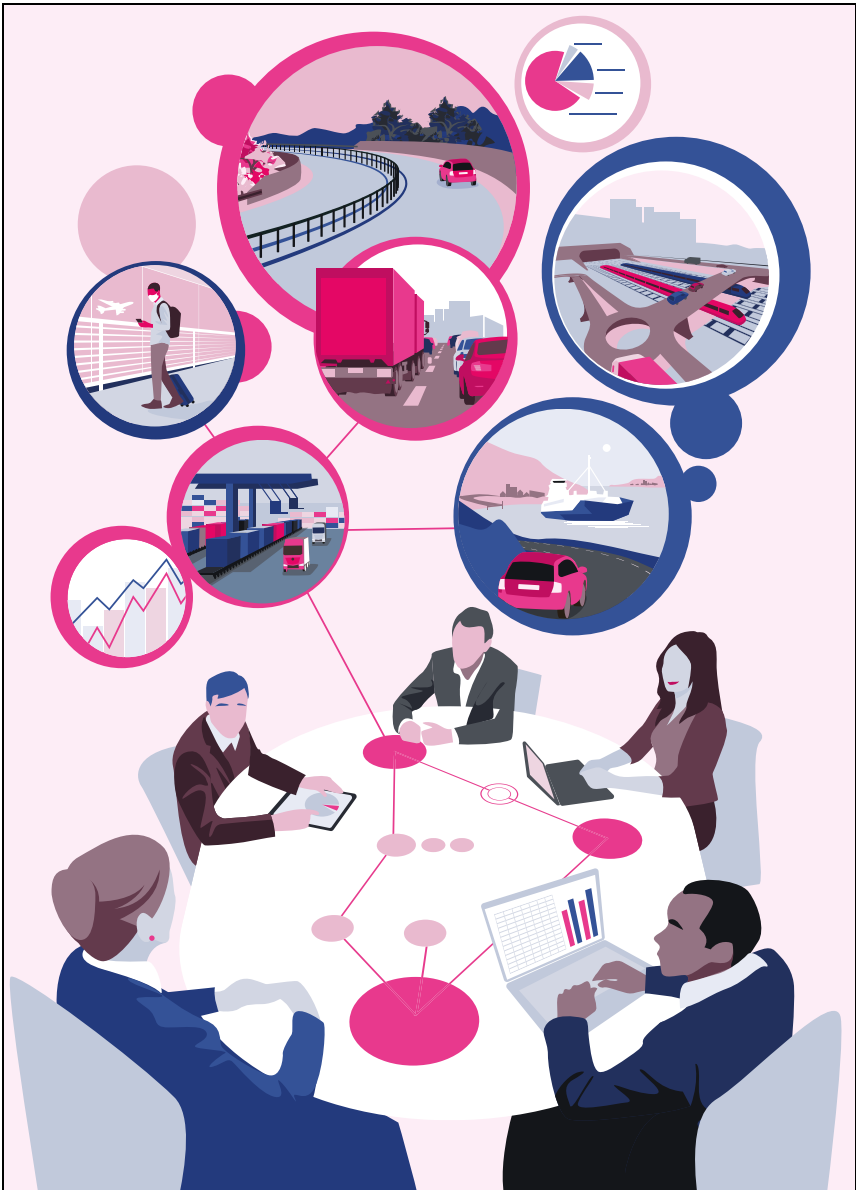
Figure 6.1 Resource allocation