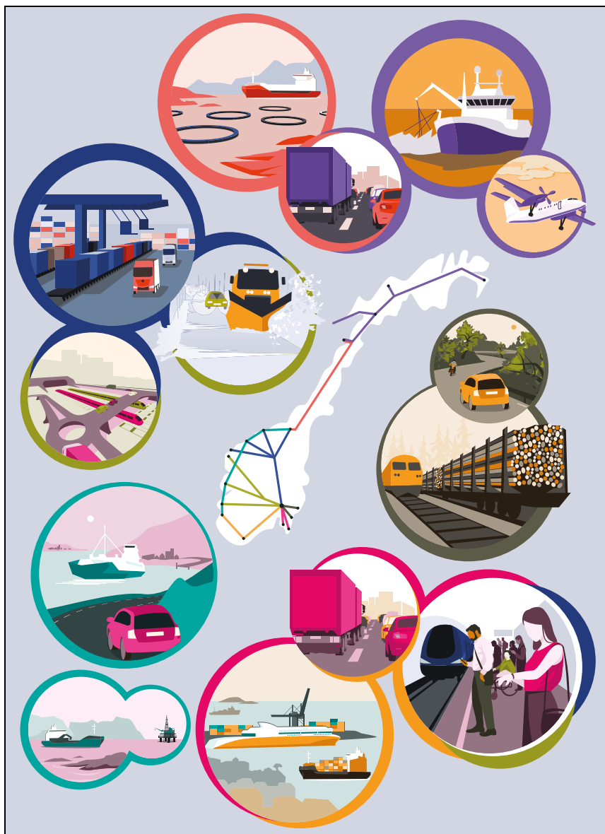
Figure 7.1 Transport corridors – different challenges and priorities