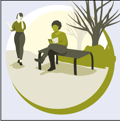
Figure 5.4 A transport sector that helps to achieve Norway’s climate and environmental goals

The transport sector accounts for almost a third of Norway’s greenhouse gas emissions. The Government’s Report No 13 to the Storting (2020–2021) Klimaplan for 2021–2030 (‘Climate Action Plan for 2021–2030’) was presented in January 2021 as a White Paper. The Climate Action Plan describes how Norway will achieve its ambitious climate goals. The Government’s climate policy for the transport sector is described in detail in the Climate Action Plan. The plan shows that, unless we intensify our use of policy instruments, there will be an emissions gap by 2030. Among