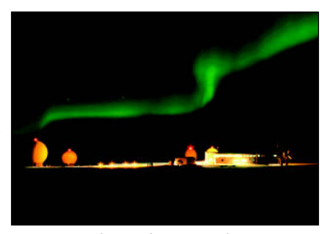
Figure 7.9 SvalSat 78 degrees North.

If the exercise of shareholder rights no longer needs to be used in conjunction with regulatory instruments in order to achieve sector policy goals, responsibility for ownership administration will be assessed differently. For other companies, the sector policy justification for state ownership may prevail for various reasons. This is because in a number of cases there are generally accepted political objectives informing state ownership of these enterprises, but in other cases it is the production and marketing structure within the sector that dictates continued full ownership by the State and sectoral affiliation for the administration of ownership. Companies with sector policy objectives should be