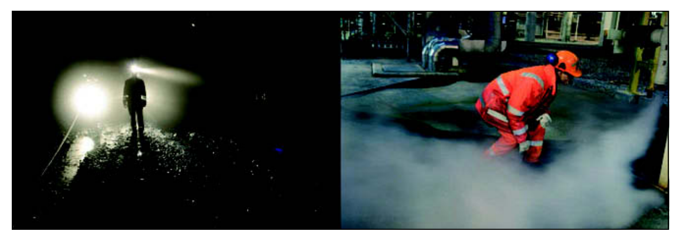
Figure 7.6 Proactive HSE work is especially important within the energy sector. The photos show operations in the Svea mine on Svalbard and at Kårstø near Stavanger.

Through responsible conduct and making demands of suppliers and other business partners, the State wants companies to contribute to increased prosperity and a positive trend in employment standards and human rights in the countries they operate in.