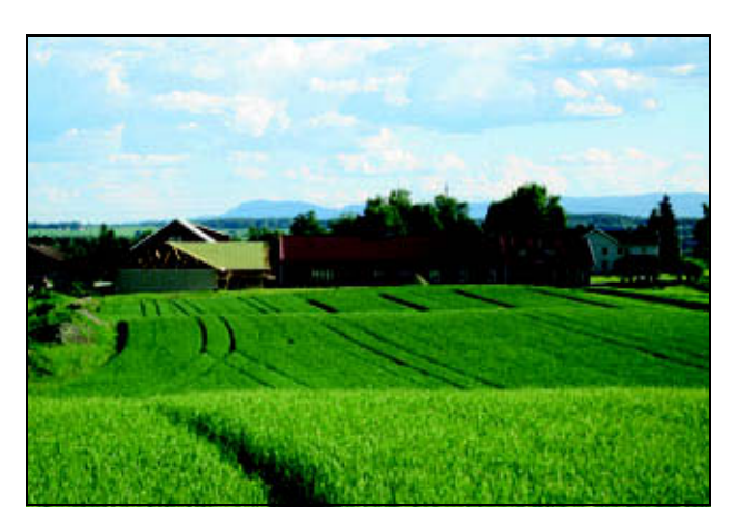
Figure 7.8 Graminor, AS of which the State, through the Ministry of Agriculture and Food, owns 34 %, manages and develops a comprehensive range of plant-breeding materials. The company has recently purchased Bjørke Experimental Farm (photo) which is also the head office for the enterprise. A new hybrid breeding house has been constructed at Bjørke in connection with the project to cultivate improved and disease-free plants adapted to a Northern climate. Graminor has enjoyed great success with the new EDEL cereal variety (a six-row barley) which has produced exceedingly good yields.

The purpose of the ownership in the commercial companies is to ensure that the State's invested