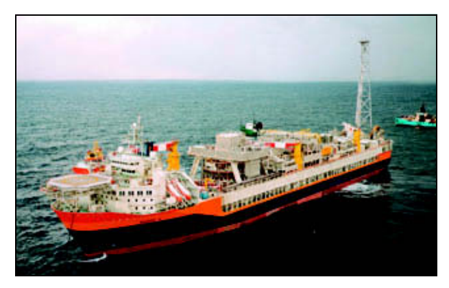
Figure 2.1 Norwegian defence technology has contributed to civil technology development. One example is the development of the business area of dynamic positioning in Kongsberg-Gruppen. The illustration shows the production vessel in the Åsgard A field, deploying dynamic positioning.

Over the course of history, the Norwegian State has played an important role in the development of