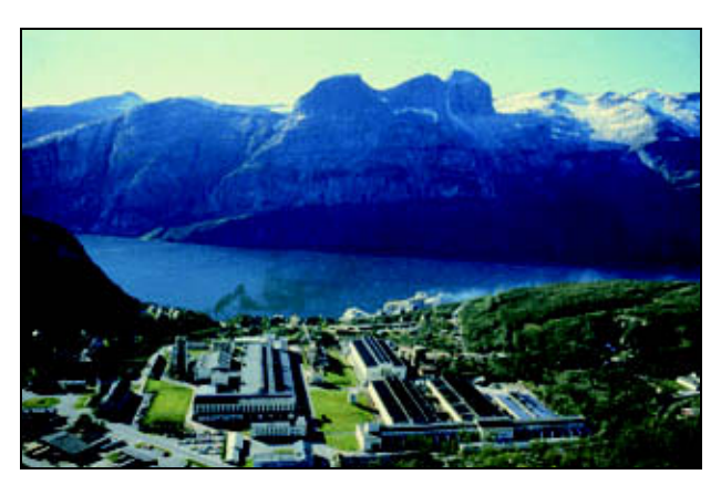
Figure 7.3 Norsk Hydro's restructuring of the Glomfjord community in the 1990s was essential. Today, this industrial community has more jobs than when reduction in the workforce first started. Norway's current solar energy business originated in the Glomfjord community in the 1990s.

The Government expects that companies with activities in Norway engage responsibly and for the long-term in readjustment processes. Restructuring in vulnerable local communities with little alternative employment is especially demanding. In order to create confidence in such demanding