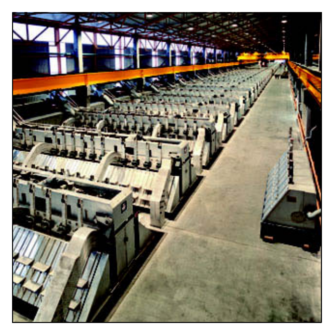
Figure 7.10 Hydro is an energy and aluminium company with 33,000 employees and with activities in some 40 countries. The Qatalum project, a 50 % joint venture company between Qatar Petroleum and Hydro, is progressing according to plan. The parties have recently signed an agreement with a Canadian company for construction of the main buildings and associated production infrastructure. Qatalum is the largest plant for the production of primary aluminium to be built in a single stage. The works will produce 585,000 tonnes a year when in full operation. There are plans for eventually increasing production to 1.2 million tonnes a year in the longer term. The construction will be based on technology developed by Hydro's technology centre in Ardal, Norwegian expertise and experience in project performance, and modelled on the new aluminium works at Sunndalsøra (photo) and experiences from there.

The Government will pursue a predictable dividend policy in wholly-owned companies. This will be achieved by the State setting out long-term dividend expectations for a period of 3–5 years in each