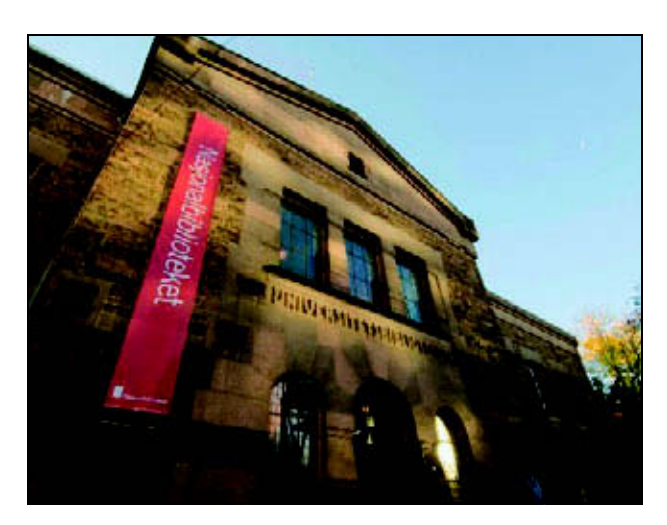
Figure 7.2 Entra Eiendom combines commerce with active corporate social responsibility. The purchase and development of the National Library of Norway (formerly the University Library) ensured timely safeguarding and storage of old and new archives. The building complex on Solli Plass, Oslo has been completely refurbished and extended to make room for an increasingly exhaustive volume of archive material.