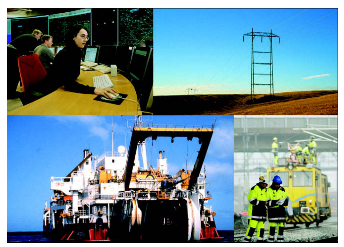
Figure 7.7 Statnett and Baneservice are examples of companies which manage infrastructure which is critical to society. The photos show the laying of submarine cables, Statnett's national terminal and the transformer station at Smestad, and maintenance workers in action at Baneservice. Baneservice maintains infrastructure critical to society

The Government is committed to Norwegian companies being proactive in terms of the recruitment