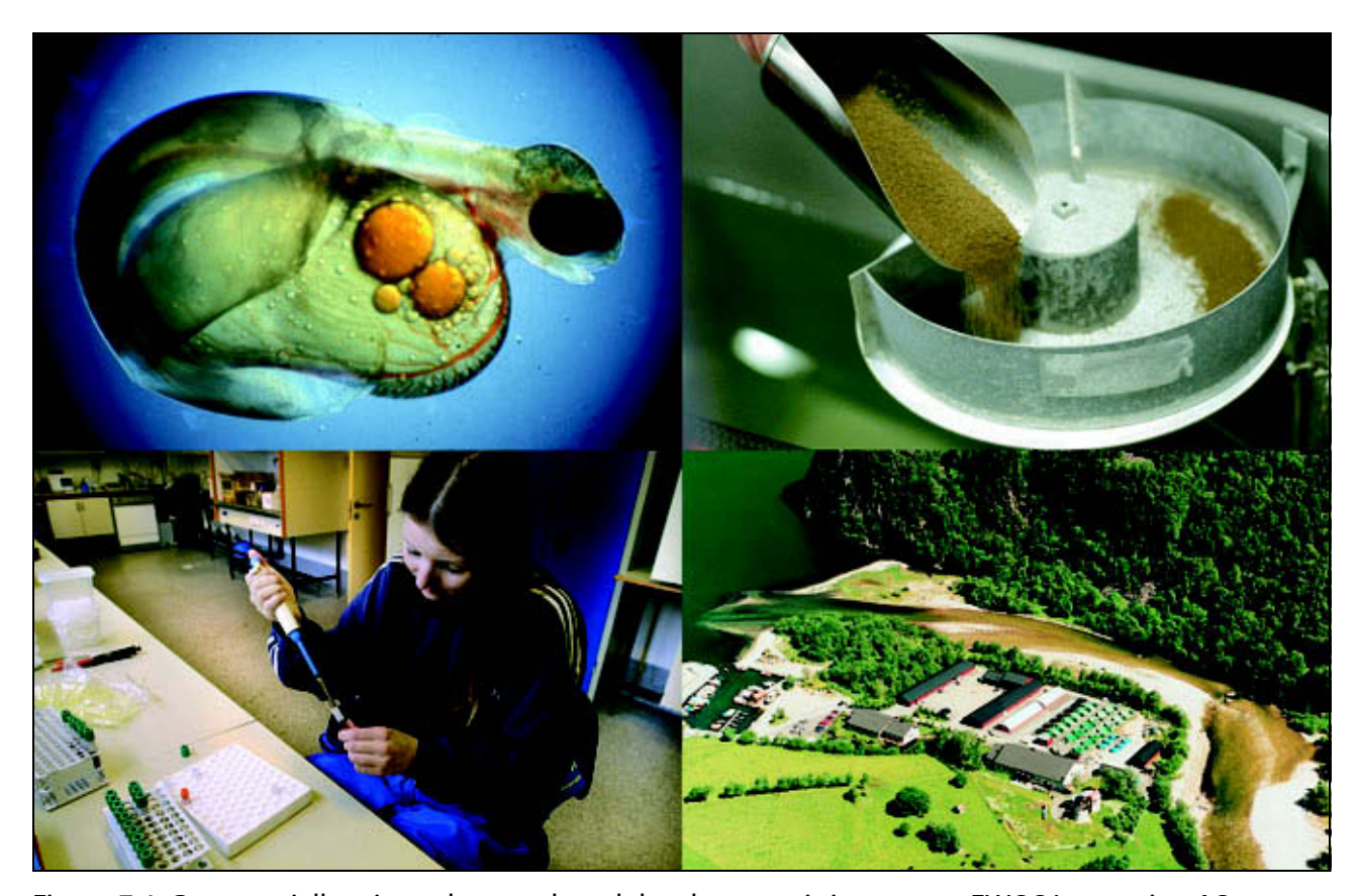
Figure 7.4 Commercially oriented research and development is important. EWOS Innovation AS develops constantly improved starter feed for anadromous fish in terms of technical quality and biological yield. Aqvaforsk AS is an important R&D actor in the early value-chain. EWOS Innovation's R&D station in Dirdal (see photo) is a world-leader.