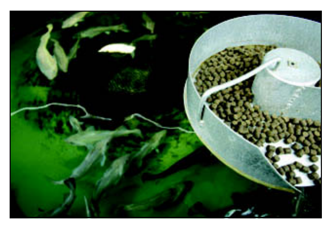
Figure 6.1 There are great expectations in the market for further commercialisation of farmed cod. Fisheries research is responsible for the National Cod Breeding Programme. The new breeding facility at Kraknes near Tromsø is currently under commissioning. Experience garnered from salmon breeding indicates that an active breeding programme is one of the most important factors in successful commercial production of cod. Cod fry is particularly sensitive to the initial feed. The photo shows feeding of cod in tubs at Ewos Innovation.

Through legislative amendments in recent years, the universities and technical colleges have gained new opportunities and a more explicit responsibility for commercialising their research results. The universities and technical colleges have seen a considerable increase in activity in this