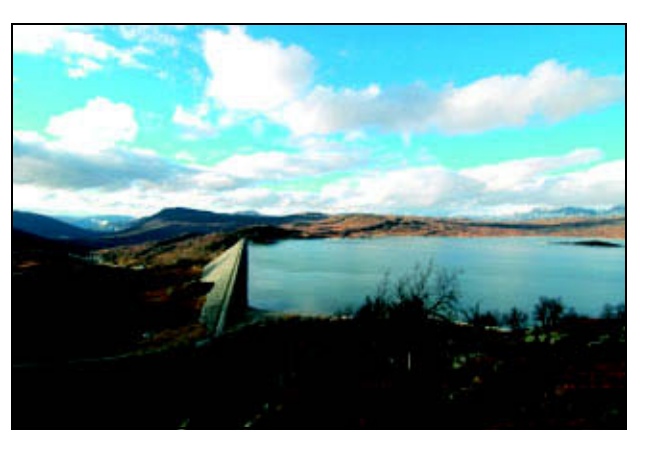
Figure 2.4 Of the non-listed enterprises, Statkraft is worth the most. Photo shows one of Norway's biggest dams, Sysendammen in Hardangervidda